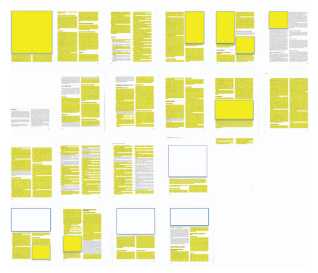
Figure 2. Complete textbook chapter from serial edition. Material identical to that in the previous edition is highlighted in yellow. To prevent identification of the textbook and chapter, figures and tables are covered with opaque boxes, page order is not respected, and the entire imprint is intentionally blurred.

of the material for the textbook. A key issue is whether the editors of the textbooks in which our plagiarized chapters were published realized that the revised material was overwhelmingly identical to that which had been previously published. We suggest 2 possibilities. (1) Editors failed to compare the original and revised versions and thus were not aware that the authors of the revision had taken credit for work that is predominantly the creation of others. (2) Editors were aware of the extent of duplication but did not believe that the ethical standards governing plagiarism of peer-reviewed articles also should apply to textbooks.